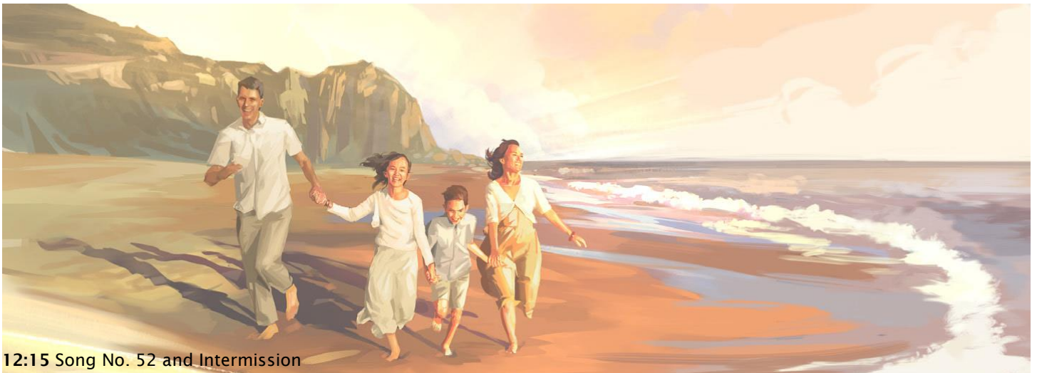
12:15 Song No. 52 and Intermission