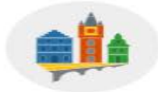
Belgium Ghent #2