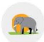
Zimbabwe Harare #1