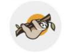
Bolivia Santa Cruz #2