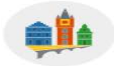
Belgium Ghent #1