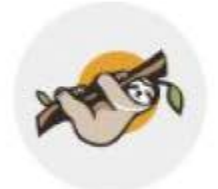
Bolivia Santa Cruz #1