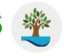
United States Sacramento (California)