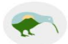
New Zealand Auckland