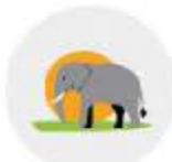
Zimbabwe Harare #2